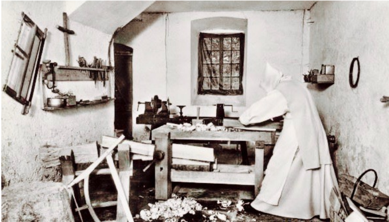
A MONK'S WORKSHOP