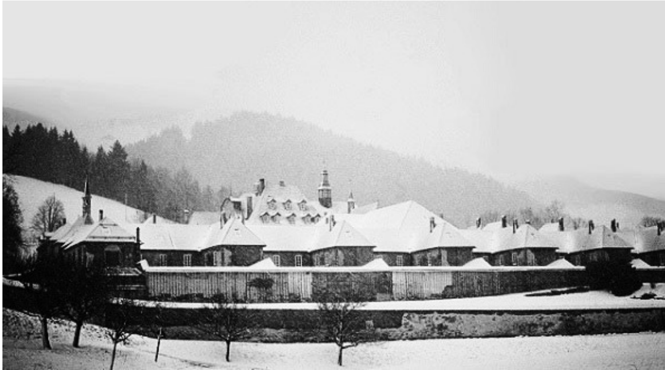
THE CHARTERHOUSE OF LA VALSAINTE