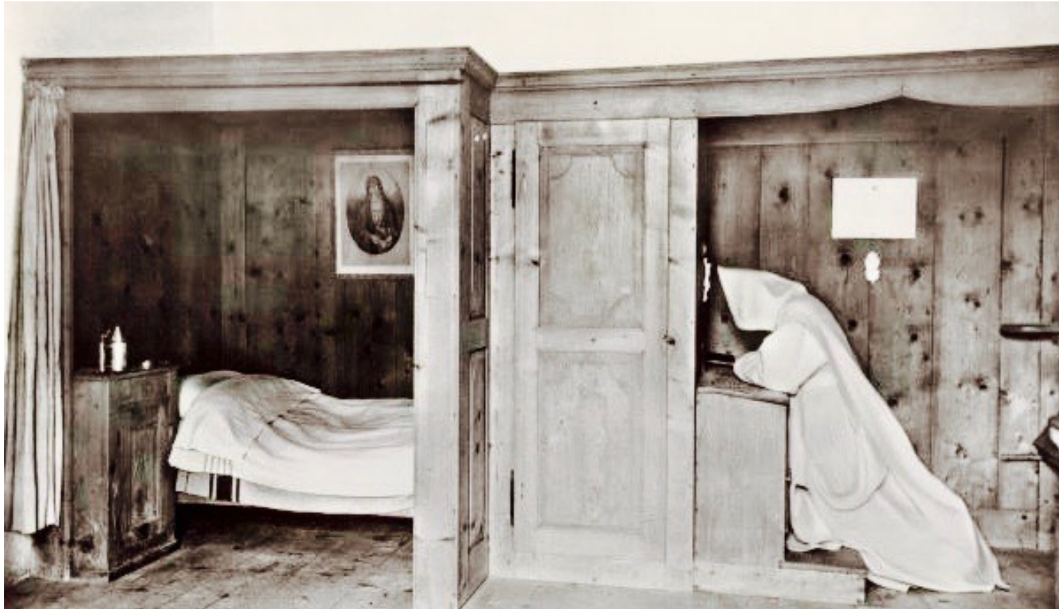
A MONK'S CELL